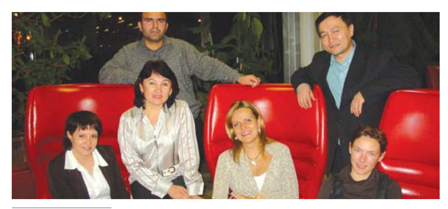
Круглый стол по Национальным институтам по правам человека в Карловых Варах

cases of human rights violations as well as making recommendations to authorities. Although national human rights institutions are state bodies, they can not be placed naturally within the institutional framework of the tripartite separation of state powers. (According to the doctrine of tripartite separation, legislative, judicial and executive powers must be separated from each other.)