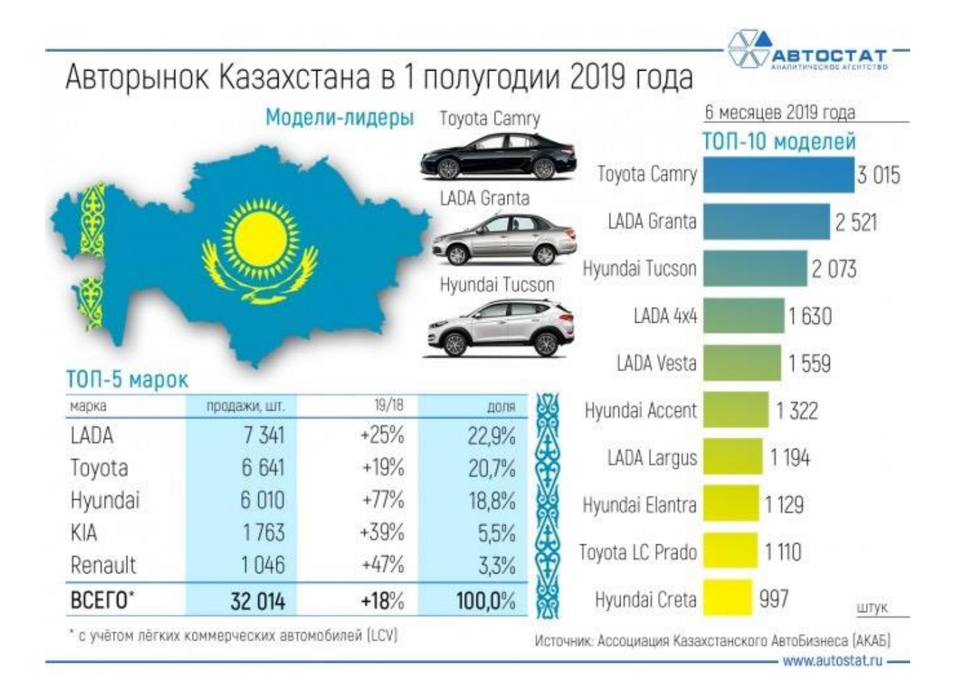
Figure 1: Segmentation of Kazakhstani car sales and major models 1.

Among some of the most popular local brands of passenger cars purchased in 2019 were Toyota Camri, Lada, Hyundai, KIA, and Renault ( Figure 1 ). Some of the brands offered by Kazakhstani enterprises also included Skoda, Chevrolet, UAZ, and Peugeot (The Astana Times, 2019).